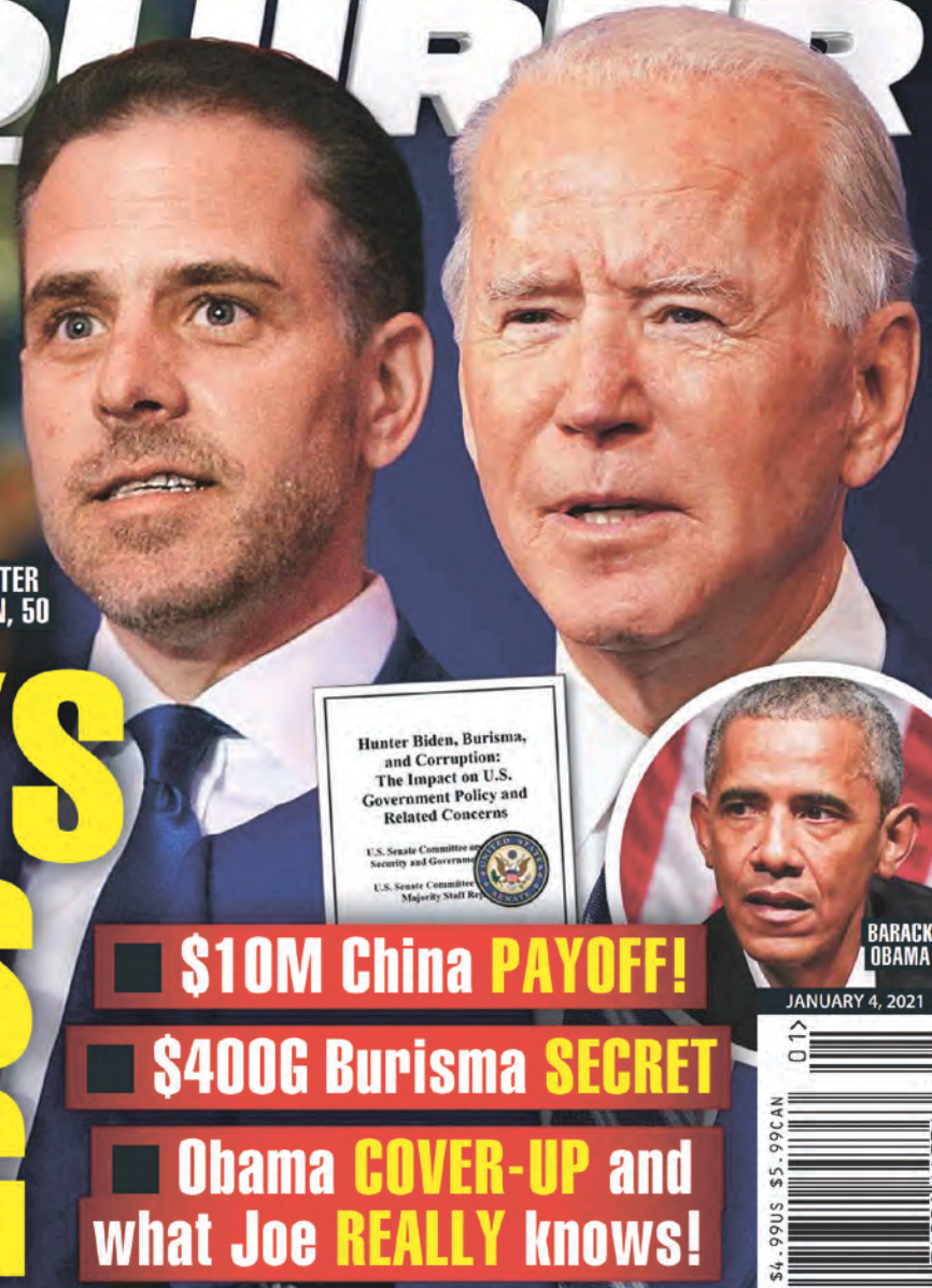
HUNTER BIDEN, 50