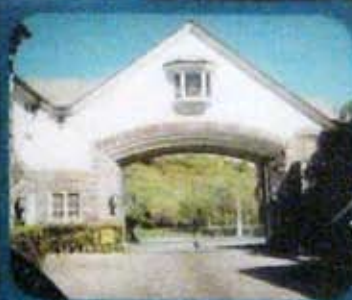
HEAVEN'S GATE: An ornate bronze entrance (above) greets guests before they are invited in to nestle by the fireplace (right) or admire Sly's collection of classical art, some of which hangs in the living room (below).