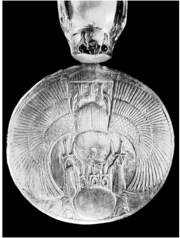
...BUT THIS SIDE UP