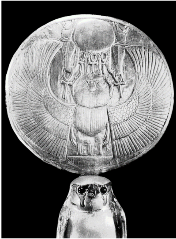
NOT THIS SIDE UP...